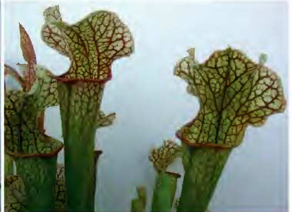
Figure 5: Sarracenia 'Stingray'.